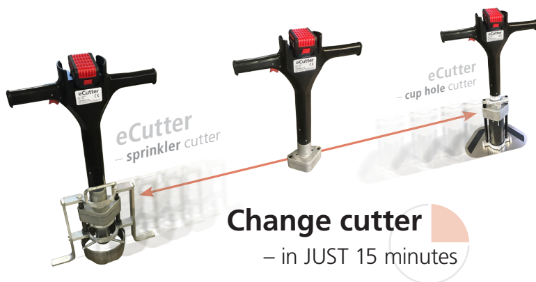
Parts that make up the cup hole cutter

Operating the eCutter is pretty straight. Just pull the trigger to start the blade action and push the handle downwards. It's that simple. By use of very little effort, the eCutter makes it extremely easy to produce a perfect hole each time.